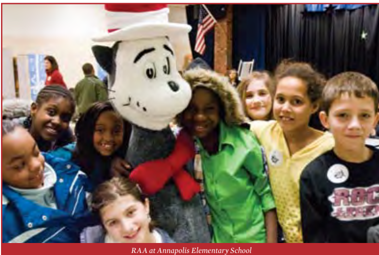
RAA at Annapolis Elementary School