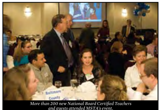
More than 200 new National Board Certified Teachers and guests attended MSTA's event.