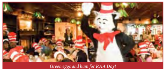
Green eggs and ham for RAA Day!