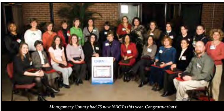
Montgomery County had 75 new NBCTs this year. Congratulations!