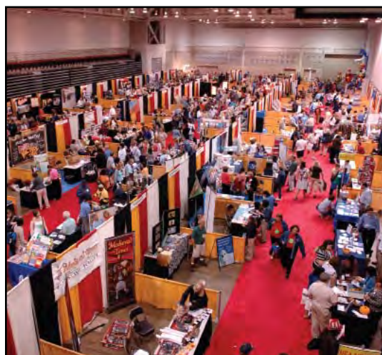
Don't miss the more than 100 vendors showcasing educational tools, perks and resources in the Roland E. Powell Convention Center's Exhibition Hall.